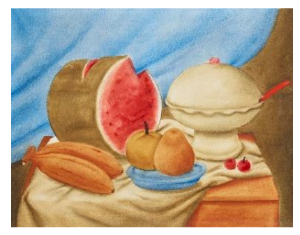
PROPERTY FROM AN AMERICAN COLLECTION FERNANDO BOTERO (B. 1932) Still Life with Soup Tureen and Watermelon watercolor on paper 43 x 54 in. Executed in 1981. Price realized: $325,000